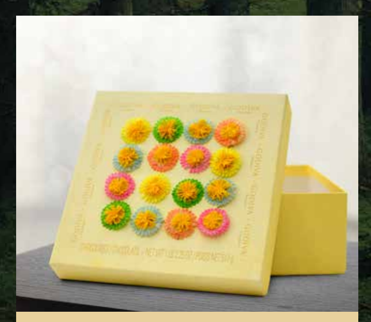
Ecological Fibers has the unique ability to produce materials sought after by the most luxurious brands in the world without the use of any harsh chemicals or heavy metals

It all began with founder Stephen Quill, when he converted a paper coating factory in Rhode Island from a chemically contaminated area featuring a building held together with blast doors and clips (designed to allow the roof to release in case of chemical explosion), into the cleanest cover material manufacturer in the world. "When Steve first went down there and saw this he said no, we won't continue down this road... we're going to do it clean or we're not going to do it at all," explained Robbins.